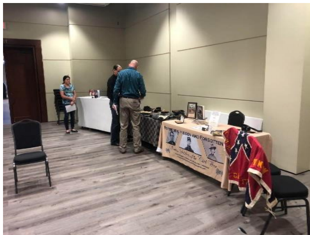
There was a Living History display at the meeting held at Beauvoir for the annual field trip.