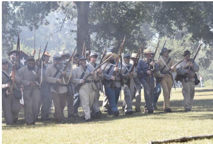
Company F of the 3 rd Mississippi moves forward to meet the Yankees and do battle with them.