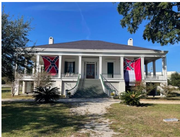
The Beauvoir House is all dressed up for the Fall Muster Weekend with the large flags.