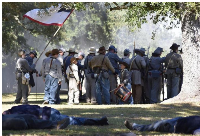
With the regimental flag flying, the 3 rd Mississippi Infantry battles to defeat the Yanks.