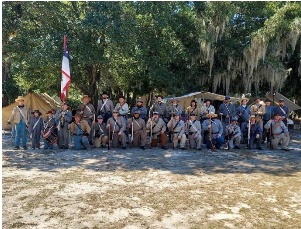
The Shieldsboro Rifles formed up for battle at Fall Muster on October 15, 2022.